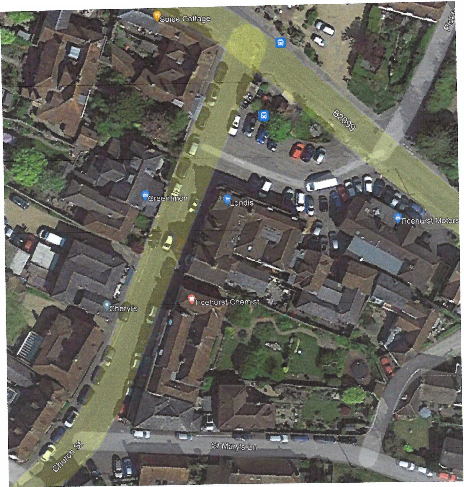
Ticehurst Village Square .